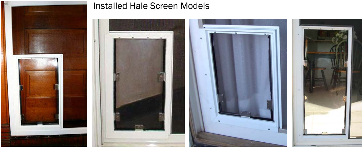
Above two units factory modified and screwed into door frame from outside.